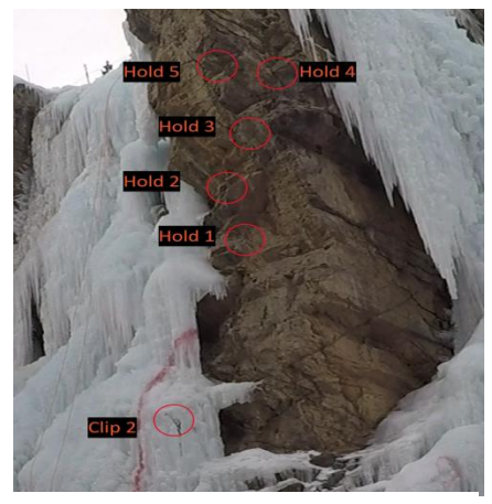
Figure 1. Lower portion of competition route showing the holds used for analysis

In total 24 climbers participated in this study (16 male, 8 female; age: 36 \pm 6.2 years; weight: 69.1 \pm 9.6 kg; height: 176.5 \pm 8.8 cm). The Fort Lewis College Institutional Review Board approved the protocol for this study and all competitors provided their written informed consent. Subjects were categorized as advanced (bottom 50% of competitors) and elite (top 50% of competitors) climbers based on their finishing rank in the competition. The competition was scored based on how high participants ascended the wall in the allotted time (8 minutes). All participants attempted the same mixed climbing route, which consisted of a short ice section, followed by a rock face and ended on a manmade feature.